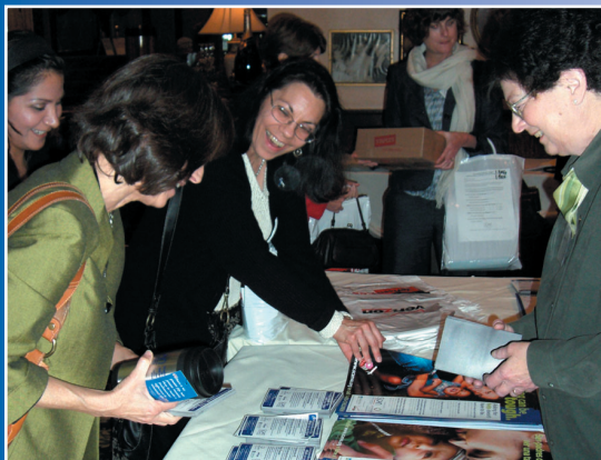
SCAN AND THE ALLIES IN PREVENTION COALITION DISTRIBUTED A RECORD NUMBER OF PUBLIC EDUCATION MATERIALS AT THE EVENT, ENSURING TENS OF THOUSANDS OF INDIVIDUALS WILL RECEIVE MESSAGES OF SUPPORT AND PREVENTION THIS APRIL AND ALL YEAR LONG.